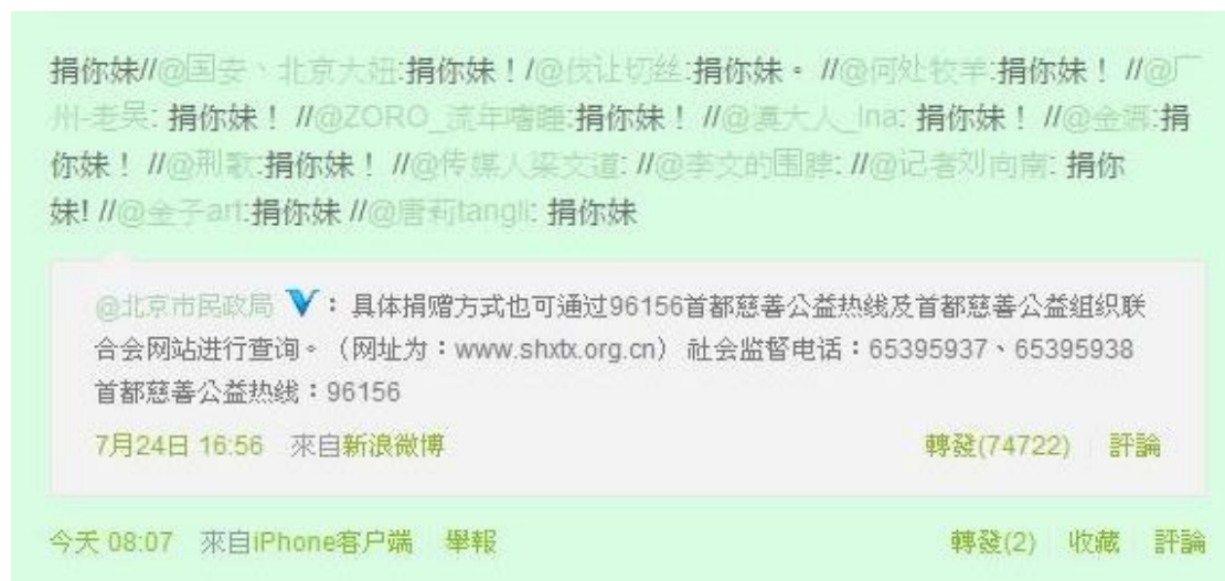
Figure 1. “Donate Your Sister” Responses

As we know, in July 2012, a heavy rain hit Beijing. Several days later, Beijing Municipal Bureau of Civil Affairs called for donations through Sina Weibo, the Chinese Twitter. But they got barely nothing but rages and criticism. Among the over seventy thousand responses, “Donate Your Sister” ranked the top 1 among all the retweets. “Your Sister”(“你妹”), a Chinese online catchphrase, means “Damn it”. Another dirty word, “Go to Hell”(“滚”) ranked the top 2.