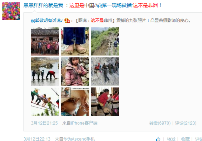
Figure 6. A tweet demonstrating the extreme poverty in countryside

Figure 6 shows the kids from remote countryside, and the extremely poor conditions of their livelihood and educations.