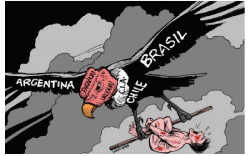
Operation Condor: US-Backed Conspiracy to "Kidnap, Disappear, Torture and Kill" Latin American Opponents of Dictatorships. <u>http://bit.ly/1NxkxAV</u>

Yet, the progress initially made by Argentina in criminal prosecutions for past human rights violations no doubt laid the foundation for this country today being the undisputed regional champion of transitional justice. After a slow period of no or small advances in prosecutions of the military and their