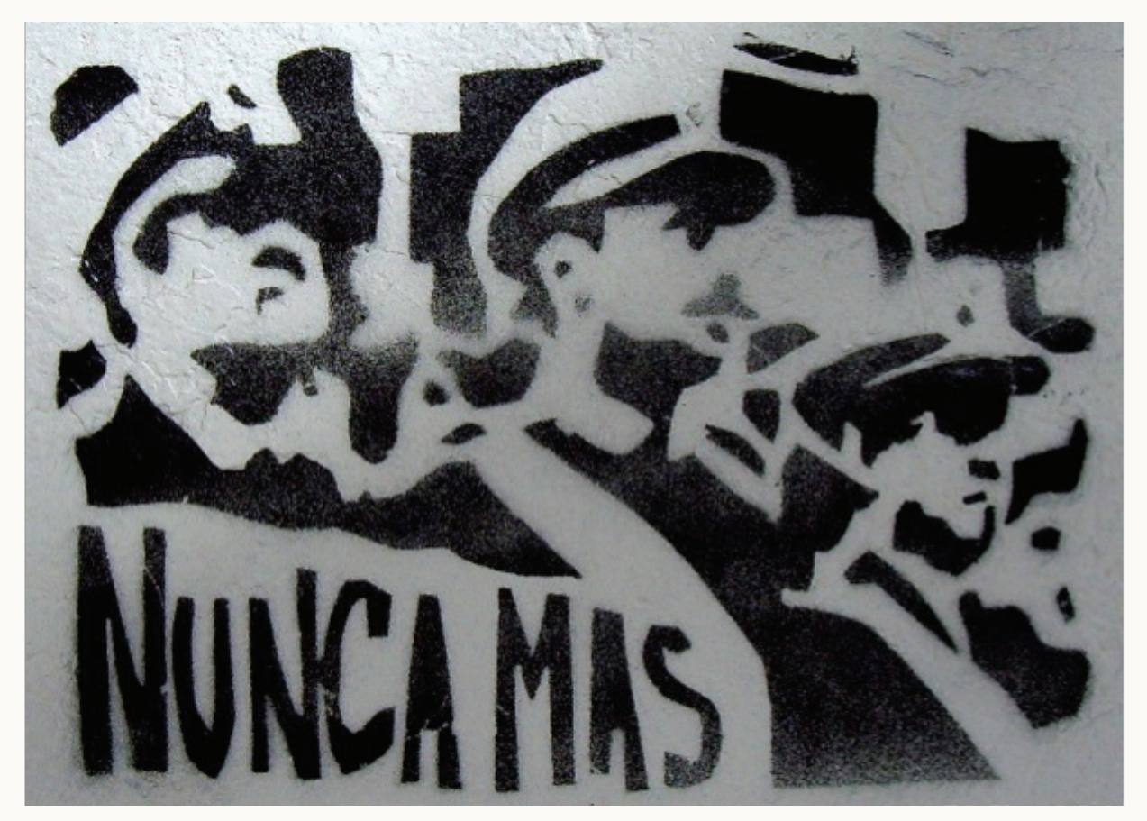
Buenos Aires graffiti of Videla and the Argentina dictatorship

These insights may be of assistance to Colombia, which is currently facing the challenge of staking out a policy of transitional justice in a context where full accountability and absolute impunity are equally unlikely. The insights from the Latin American experience with criminal justice for past wrongs could also be worth considering for countries elsewhere in the world (such as the post-spring Arab region) that are in the midst of transition from internal armed conflict to peace, or from military dictatorship to democracy, and have to make some tough political and legal choices regarding how to deal with their military. The aim must be "Never Again" human rights violations – Nunca Mas.