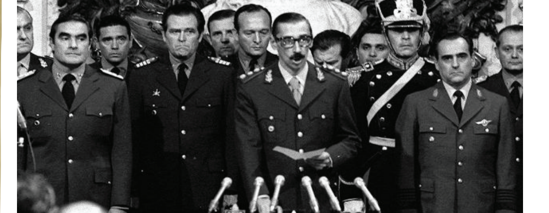
Former Argentine dictator Jorge Rafael Videla attends the last day of his trial in Cordoba, Argentina.