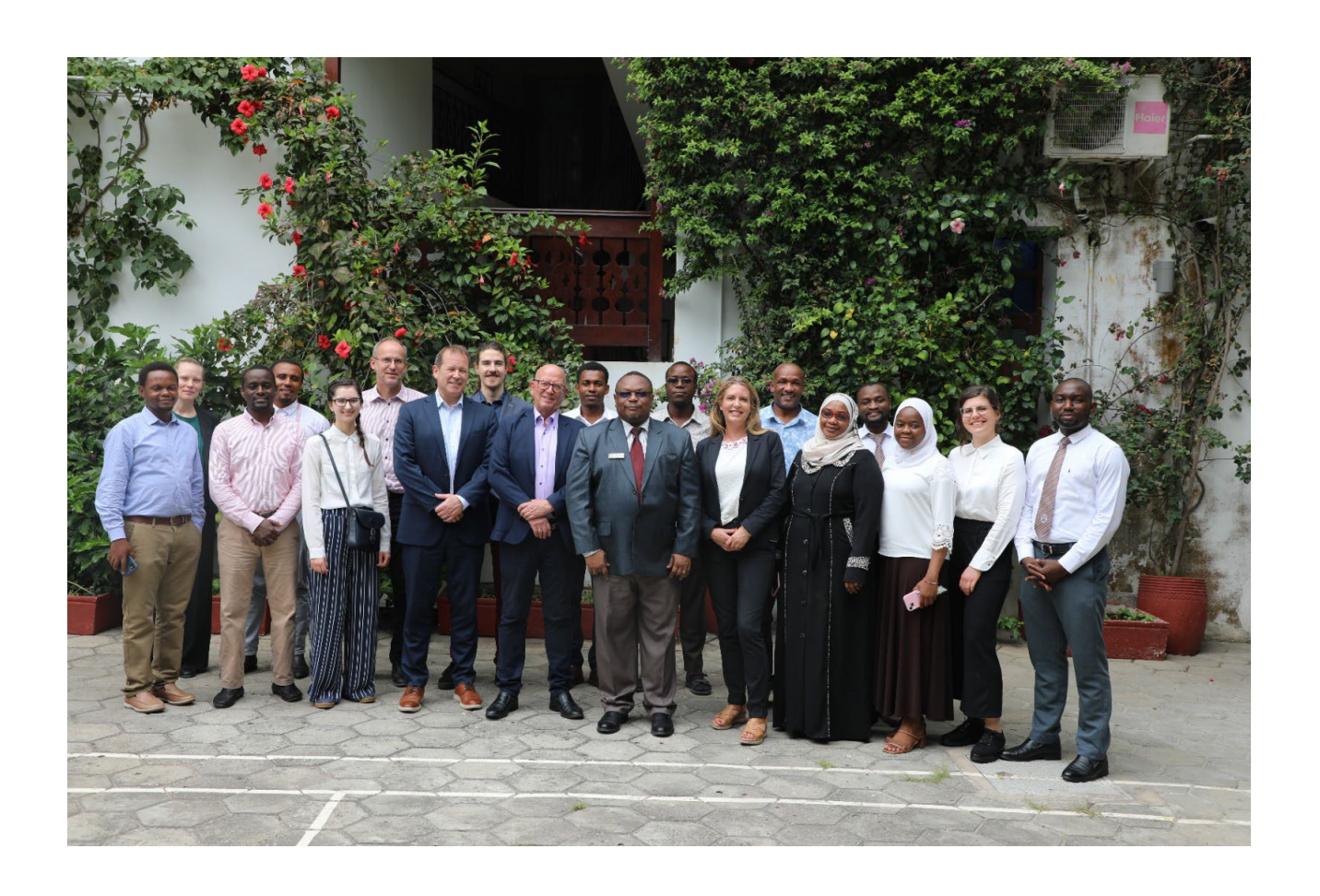
Annual Report 2023