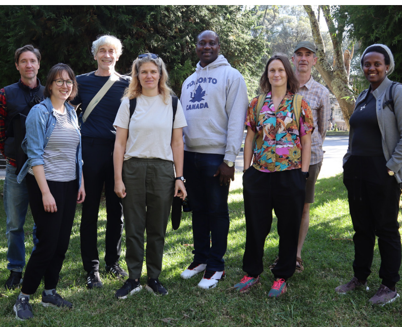
EFFEXT project team at Addis Ababa University.