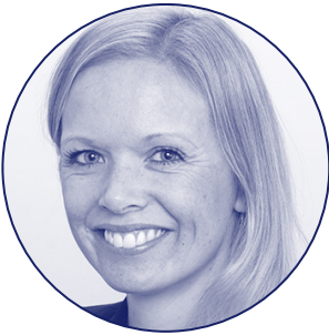
Secretary-General Catharina Bu United Nations Association of Norway (UNA Norway)