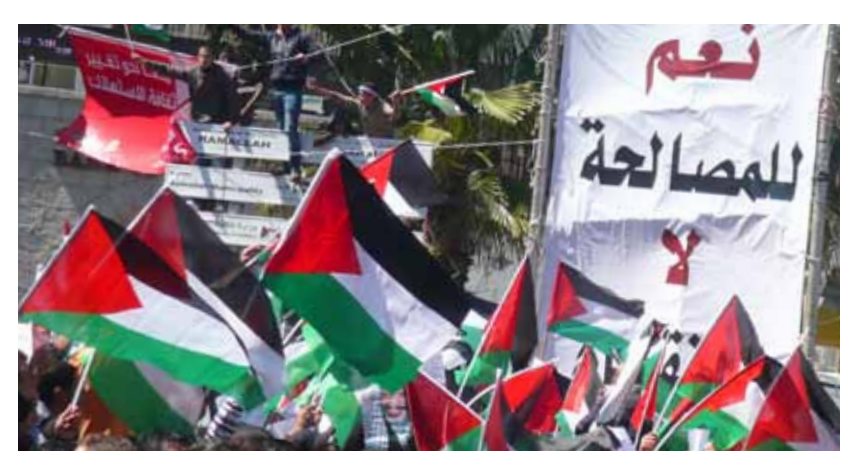
"Yes to reconciliation"