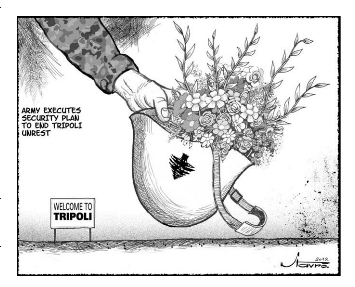
Figure 3: Tripoli Security Plan © Stavro Jarba, reproduced with permission

do was trying to contain the conflict within pre-set "red lines" and prevent either community from being overrun. The army is accused of being Hezbollah-controlled, but both communities embrace the army as a protector and as the only force capable of preventing the conflict from spiralling out of hand. Nonetheless, sniper fire and clashes not only kills soldiers and fighters, but also children, teenagers and women.