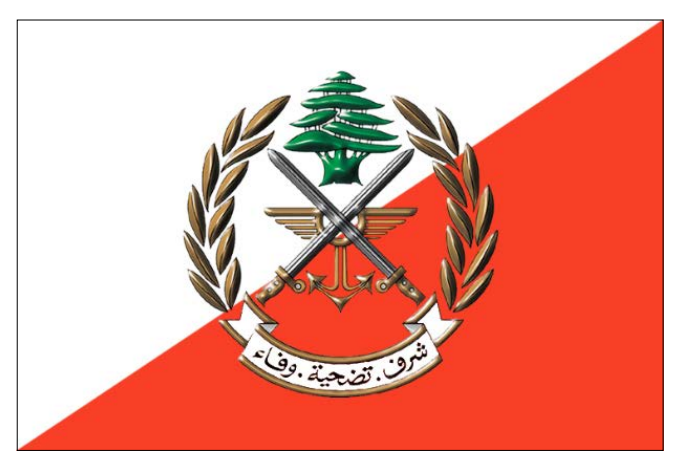
Figure 1: Flag and motto of the Lebanese army: "Honour, Sacrifice, Loyalty"

The bloody Nahr el-Bared campaign started a new and worrying trend: turning the Army into a political target. In late 2007, the army commander in charge of the siege of the camp was killed by a car bomb, followed soon after by twin bus bombs killing army personnel. The deadly attacks made the army start commemorating slain soldiers and officers as martyrs ( shaheed ). This is a martyrology, common in Lebanon, which posterises and commemorates victims in annual memorials and vigils. Unlike the country's numerous confessional martyrs, memorials of slain army soldiers portray them as martyrs of the nation, hence validates the army's motto of honour, sacrifice and loyalty to the nation (Figure 1).