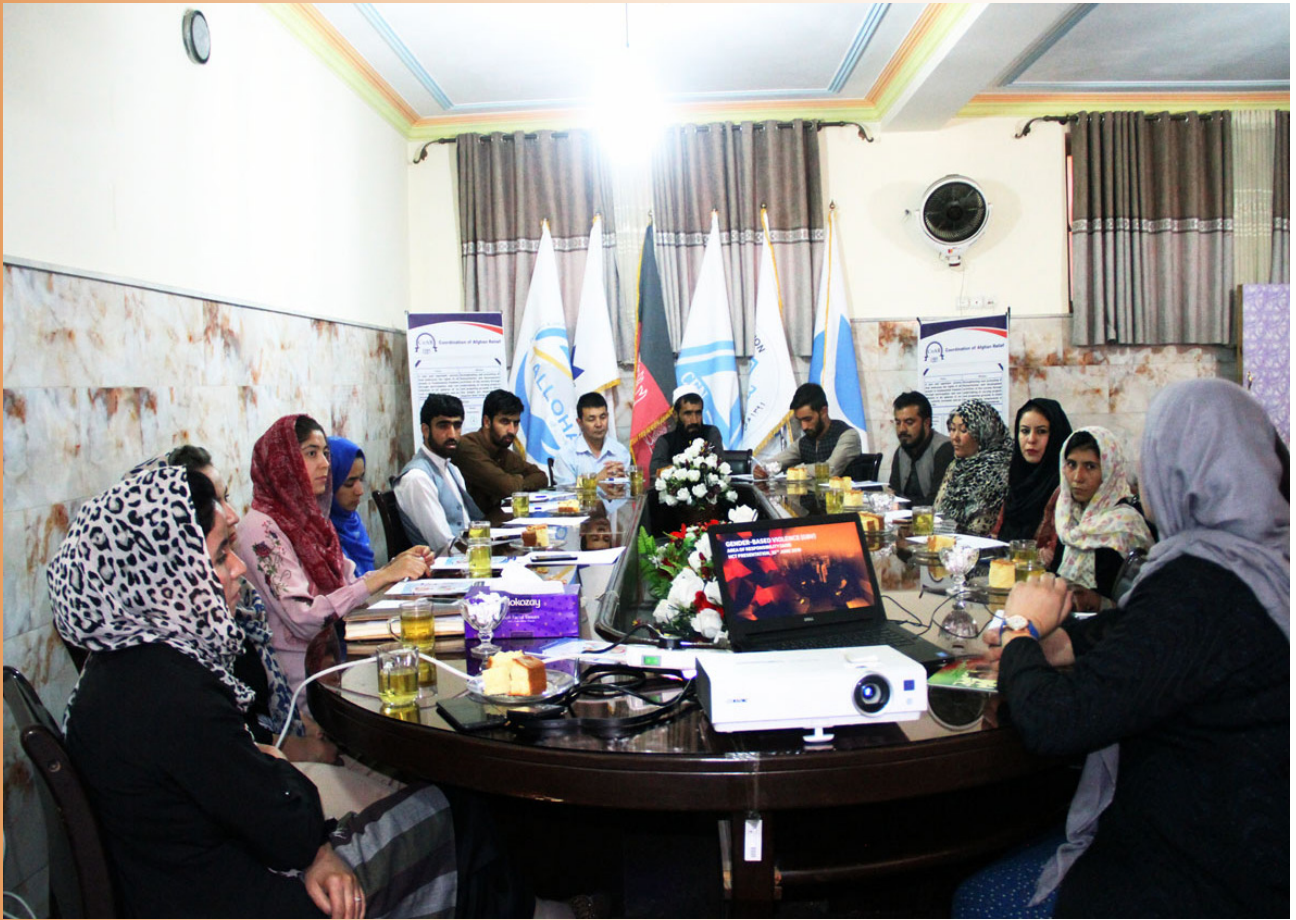
Fig .8 - COAR Capacity building program and more focusing on female staff training, 2022.