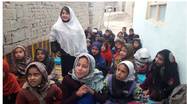
Fig.7 - Community based education program in Kandahar province, financially supported by IRC, 2022.