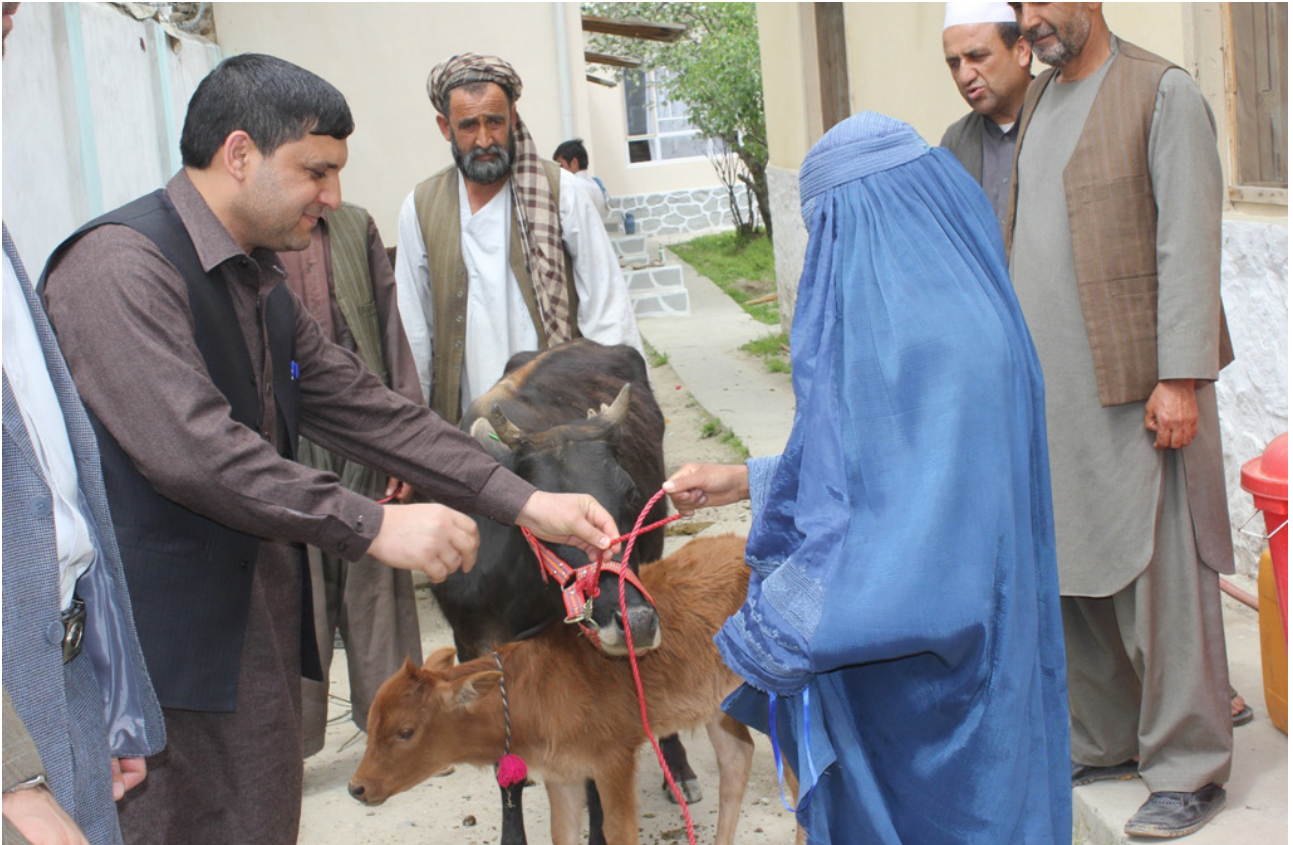
Fig.2-TUP project in Badakhshan province (Assets distribution), financially supported by MISFA/World Bank 2016.