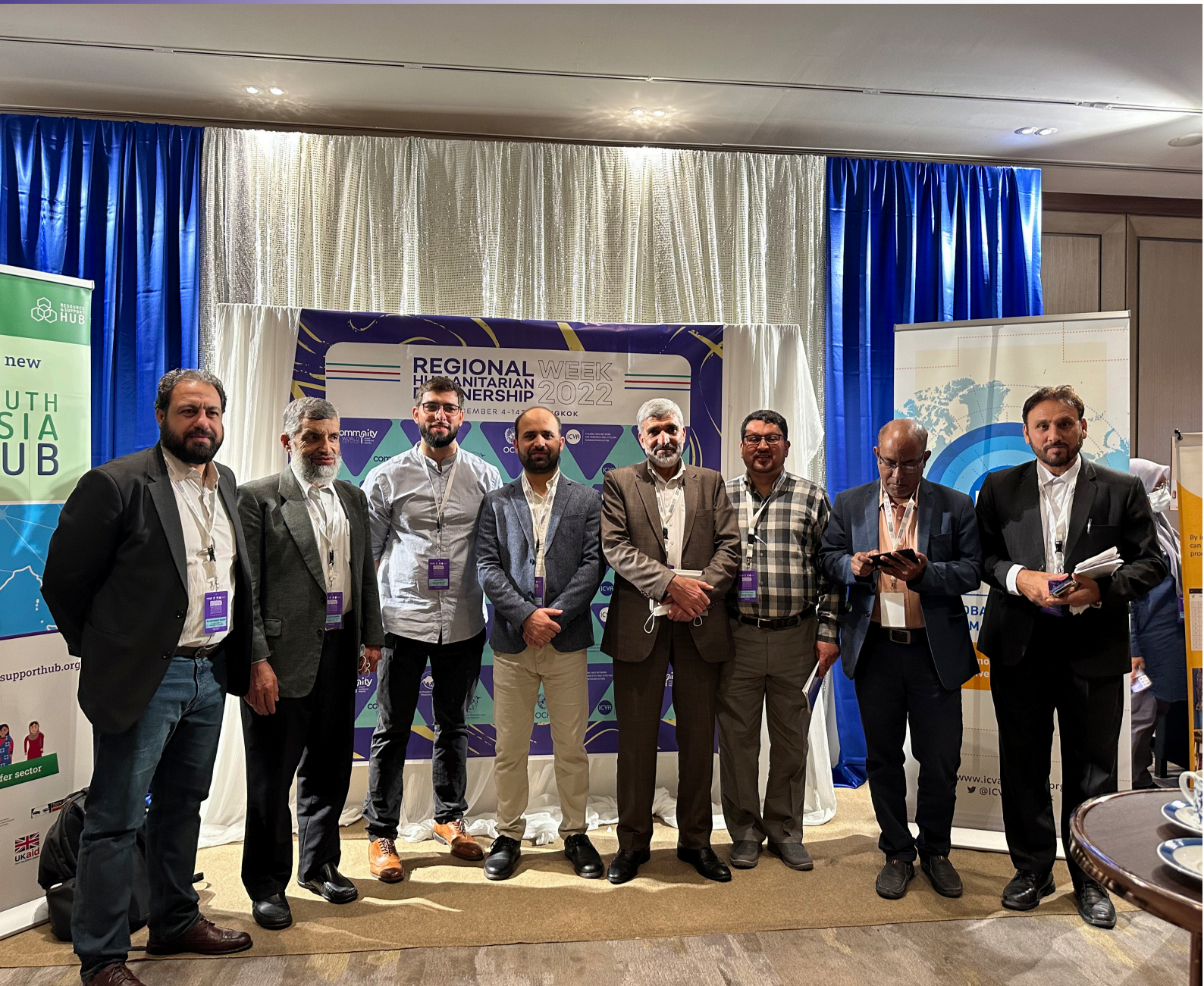
Fig.5- COAR and other Humanitarian Actors active participation in Regional Humanitarian Partnership Week, Bangkok, Thailand 2022.