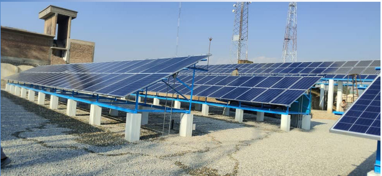
Fig.9 - Solar system and Water supply project in Laghman province, financially supported by UNICEF, 2022.