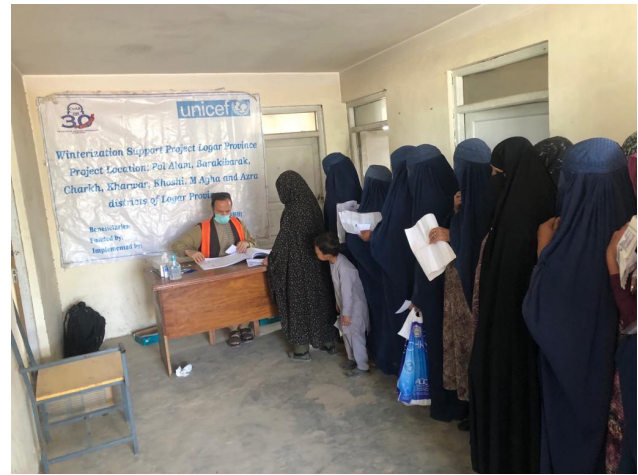
Fig.1- Winterization (Cash distribution project ) in Logar Province, financially supported by UNICEF (2022).

The Taliban movement that came to power in August 2021 and established the Islamic Emirate of Afghanistan (IEA) has so far not been recognised by any State, but rather has become subject to a range of international sanctions. External aid has largely been reduced to humanitarian assistance and for meeting basic needs and channelled through United Nations (UN) agencies and NGOs. The reserves of the Afghan central bank are frozen and national banks face problems with transfers, which all together has led to a worsening economic situation across the country. Large parts of the Afghan population have ended up under the poverty line, half of the population needs