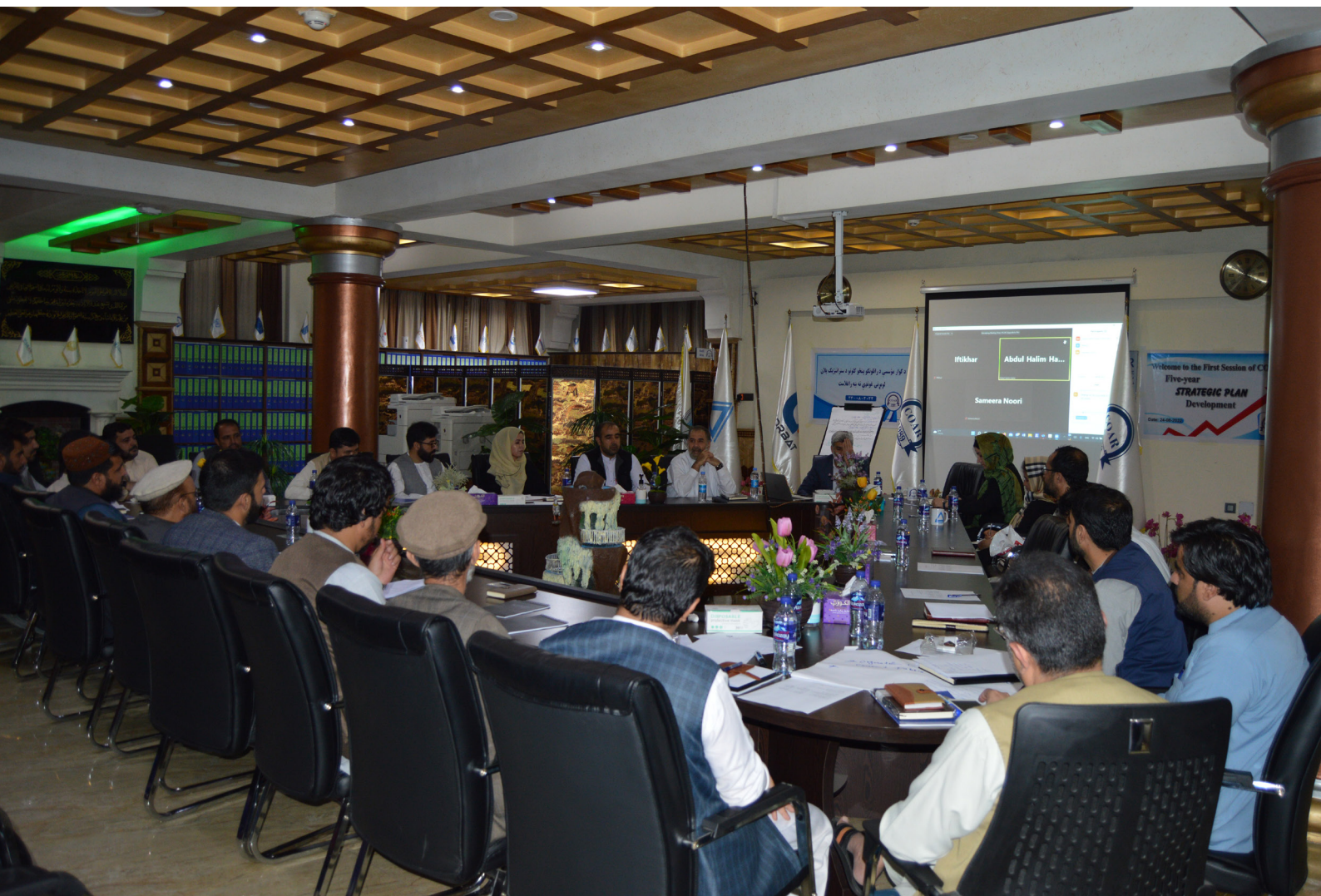
Fig.4- COAR key staff consultation workshop for developing new Strategic plan, 2022.