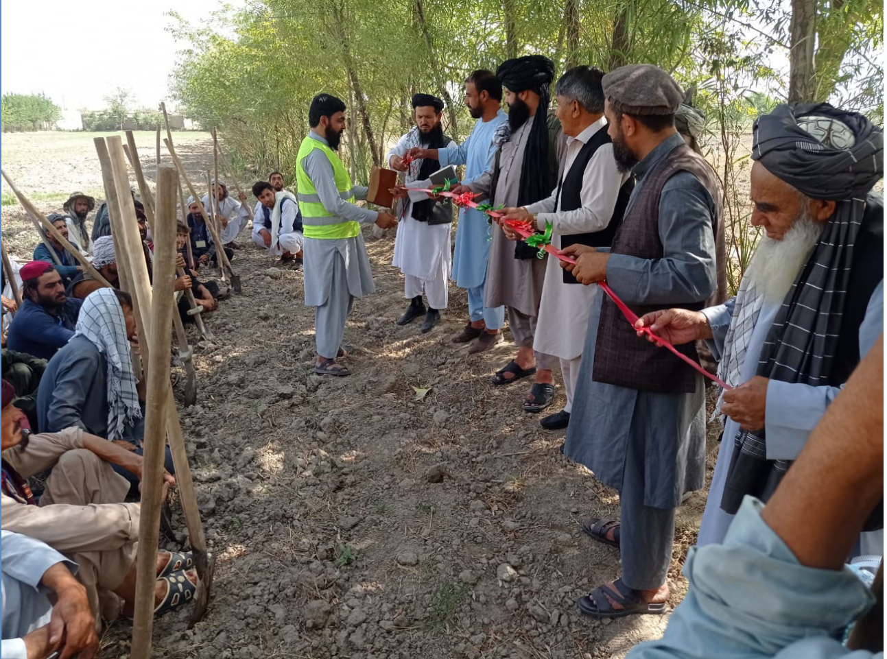
Fig.3- Cash for work project (Assets creation) in Kunduz province, financially supported by NEAR network, 2022.