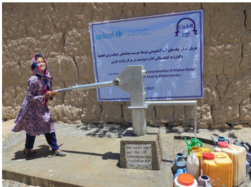
Fig.6- WASH project in Ghazni province, financially supported by UNICEF, 2017.