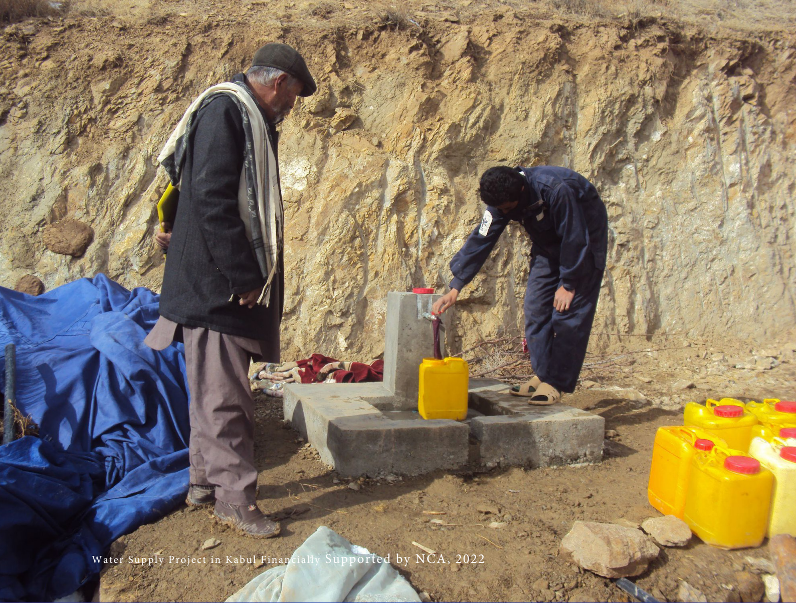
Water Supply Project in Kabul Financially Supported by NCA, 2022