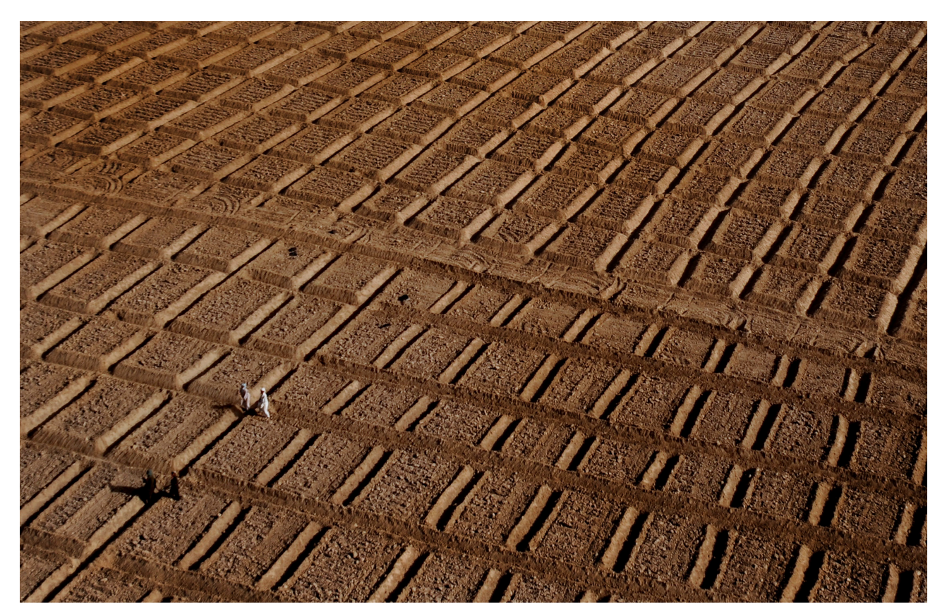
Afghans prepare their fields for farming as the weather begins to warm up in Southern Afghanistan. Photo by Kenny Holston (CC BY 2.0).

The fall of the Taliban regime in 2001 was followed by a massive flow of international aid that fueled record high economic growth in Afghanistan. A large amount of both military and non-military aid went to infrastructure building which created a vast number of jobs in both the public and private sectors. Concurrently, there was considerable progress in the health sector, and to some degree the education